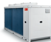
Belaria® fit (85): up to 1.4 MW