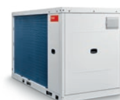
Belaria® fit (53): up to 853 kW