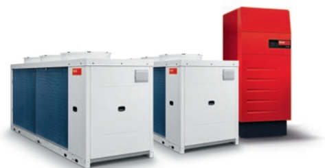
Bivalent hybrid system with Belaria® fit and gas condensing boiler UltraGas®.

With Belaria® fit, efficient systems with a high proportion of renewable energies can be planned. As a monovalent system, up to 1.4 MW is possible. Bivalent hybrid systems can even supply up to 4 MW – depending on the required proportion of renewable energies.